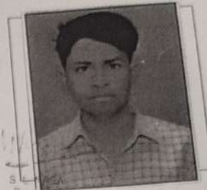
S. L. NASA Registrar Delhi Pharmacy Council

REGISTRATION No 30830 DATE OF REGISTRATION 27.06.2019 DATE OF RENEWAL (PERIOD) 01.01.2024 to 31.03.2024