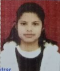
Registrar, Uttarakhand Pharmacy Council Dehradun, Uttarakhand

has been duly registered as a Registered Pharmacist, u/s 32(2) of the Pharmacy Act 1948 and is entitled to all the privileges granted under the Pharmacy Act 1948 (8 of 1948). In witness whereof are herewith affixed the seal of the Uttarakhand State Pharmacy Council and the signature of the Registrar.