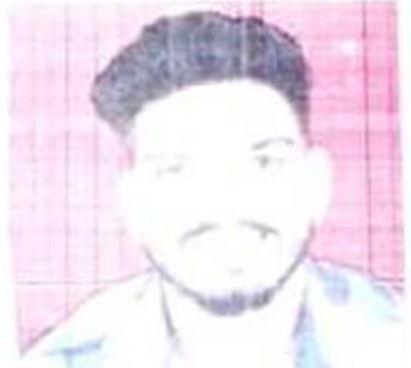
Registrar Uttarakhand Pharmacy Council Dehradun, Uttarakhand

has been duly registered as a Registered Pharmacist, u/s 32(2) of the Pharmacy Act 1948 and is entitled to all the privileges granted under the Pharmacy Act 1948 (8 of 1948). In witness whereof are herewith affixed the seal of the Uttarakhand State Pharmacy Council and the signature of the Registrar.