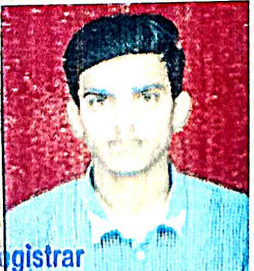
Registrar Uttarakhand Pharmacy Council Dehradun, Uttarakhand

has been duly registered as a Registered Pharmacist, u/s 32(2) of the Pharmacy Act 1948 and is entitled to all the privileges granted under the Pharmacy Act 1948 (8 of 1948). In witness whereof are herewith affixed the seal of the Uttarakhand State Pharmacy Council and the signature of the Registrar.