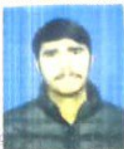
Reg. Uttarakhand Pharmacy Council Dehradun, Uttarakhand

has been duly registered as a Registered Pharmacist, u/s 32(2) of the Pharmacy Act 1948 and is entitled to all the privileges granted under the Pharmacy Act 1948 (8 of 1948). In witness whereof are herewith affixed the seal of the Uttarakhand State Pharmacy Council and the signature of the Registrar.