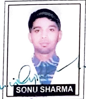
Haryana State Pharmacy Council PANCHKULA